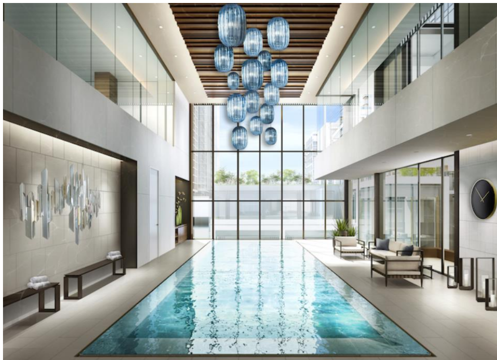
The indoor relaxation pool at EchelonSeaport by Jeffrey Beers International.