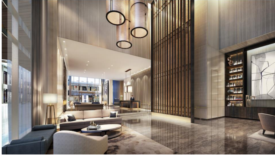
The lobby at 133 Seaport by Jeffrey Beers International.