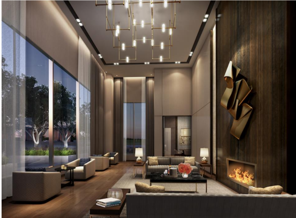
The fireplace lounge at 133 Seaport by Jeffrey Beers International.