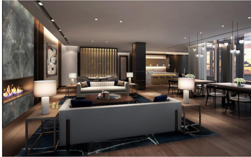
The sky lounge at 133 Seaport by Jeffrey Beers International.