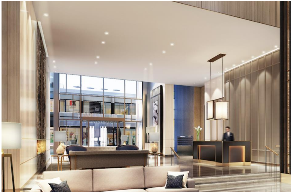
The lobby at 133 Seaport by Jeffrey Beers International.