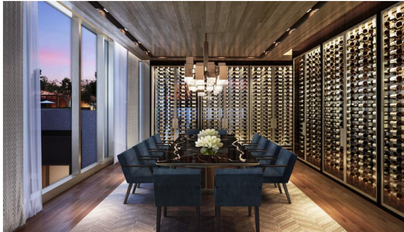
The wine room at 133 Seaport by Jeffrey Beers International.

Boston's EchelonSeaport , a luxury residential complex, won't be completed until next year, but new renderings give an early look at the interiors designed by Jeffrey Beers International . The complex will consist of three towers, anchored by a central courtyard, that encompass a whole city block in the Seaport District. JBI will shape over 60,000 square feet of amenity spaces, including lobbies and lounge areas, indoor fitness areas, and a sky lounge in each tower. The design channels Boston's timeless American style and Beers' experience in the luxury hospitality industry. Other members of the architectural team include Kohn Pedersen Fox and local firm CBT Architects, who collaborated on the exterior. Regent Hotels & Resorts will provide luxury services to the condominiums. Construction is expected to be completed by 2020.