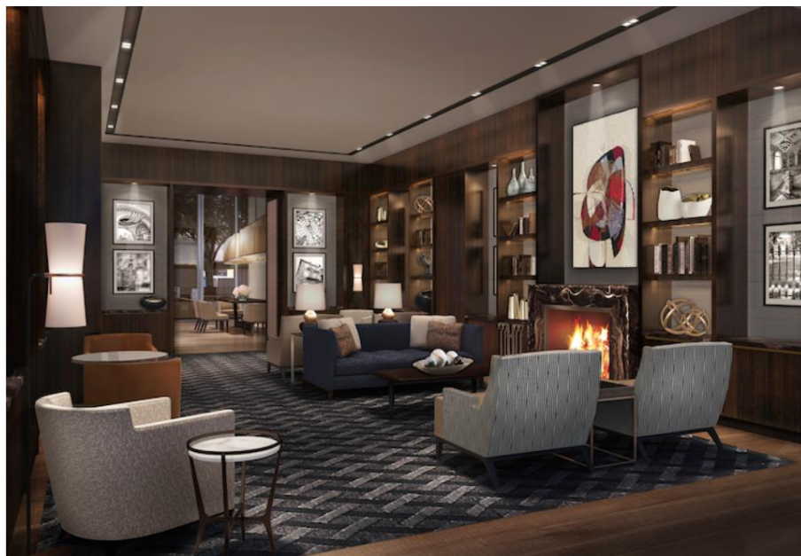
The library at 133 Seaport by Jeffrey Beers International.