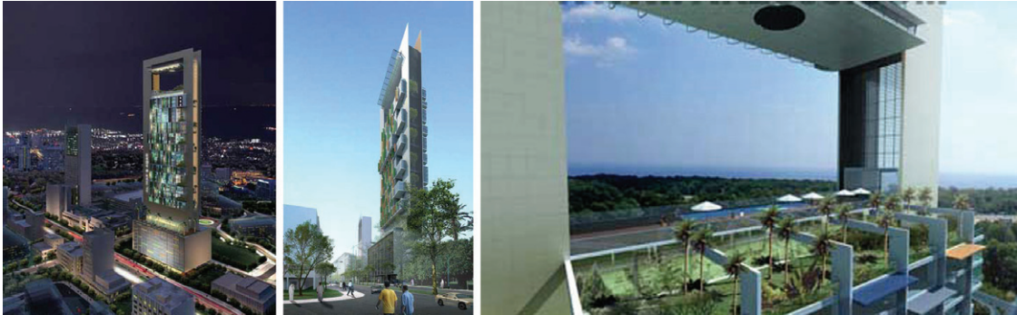
Fig. 2. (a) Atkins, office of Al Sharq; (b) day scene; (b) top-level structure

The development of modern high-rise building tends to large size and multi-functional, although the technology of air-conditioning can provide a variety of artificial climate, but it also consumed large amounts of energy, so the utilization of natural energy is very important in its sustainable development. Thus, we can shape the architectural forms to adapt to the local climate, and empower the building with the ability to improve its interior microclimate. For example, when designing Al Sharq office (the winner of Future Architecture Award, MIPIM), Atkins has attached great importance to the local climate of Middle-east. Sheet structure with green plants was utilized in the main body to reduce the load of sandy base, and keep interior space from direct sunlight. On the top level, the huge open hole which link to atrium also can accelerate the indoors' air ventilation and introduce in lighting, and providing a beautiful viewing platform for users at the same time, see Fig 2(a); (b); (c).