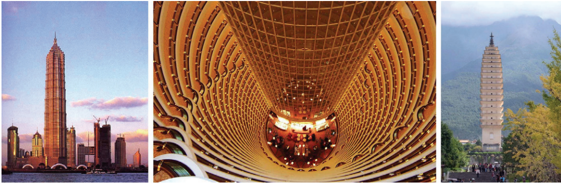
Fig. 3. (a) Jin Mao mansion, Shanghai; (b) interior; (c) Qianxun pagoda of the Chongsheng Temple, Dali, Yunnan

Information technology is another important factor to promote the modern high-rise building. It brings us the intelligent building, which combines computer and communication technology to high-rise buildings. It can automatically adjust the internal environment, though monitoring the external situation of the weather, temperature, humidity and wind, etc. Offering us the space environment with efficient, comfortable, energy saving and safety. Intelligent development can enhance the investment value and protect the environment, and maximum utilizing the resources. It will positively stimulate the development of high-rise buildings to achieve the goal of green and sustainable